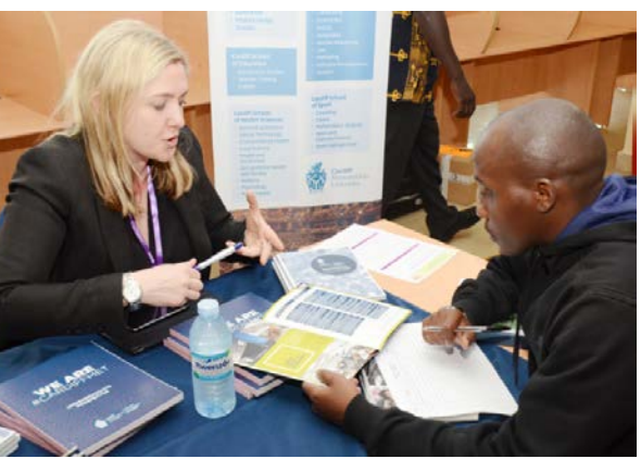
Cardiff Metropolitan University