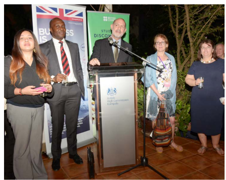
British High Commissioner acknowledges UK University represesentatives