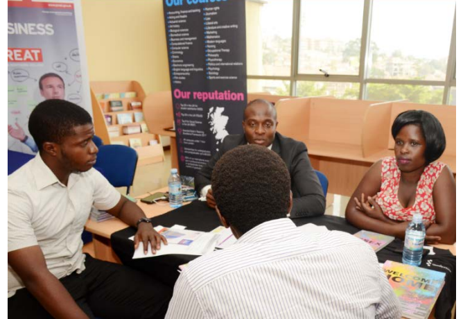
University of Exeter