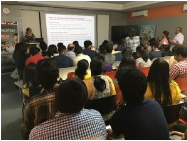
UK Visas session in Chennai and Mumbai