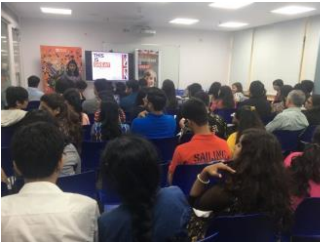
A full house in Kolkata