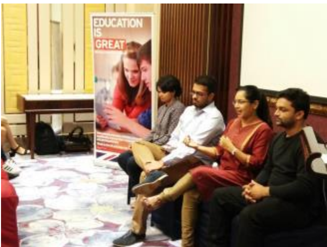
Alumni session in Pune