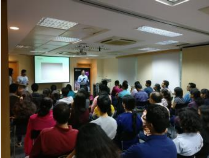
Pre-departure briefing at Bangalore