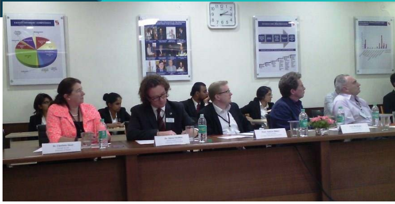
Faculty discussion at Symbiosis Law School