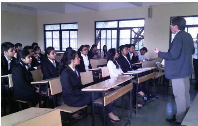
At New Law College Pune