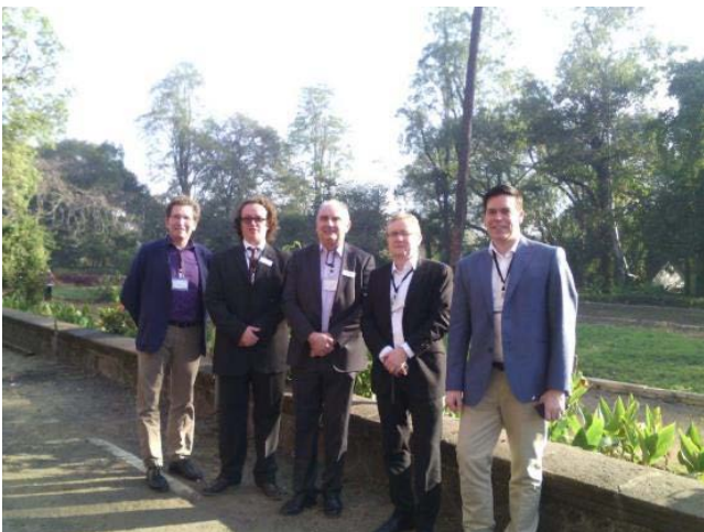
Delegates outside the main building at Pune University