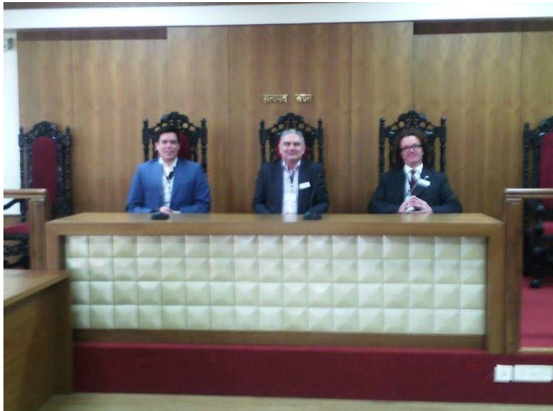
In a MOOT Courtroom