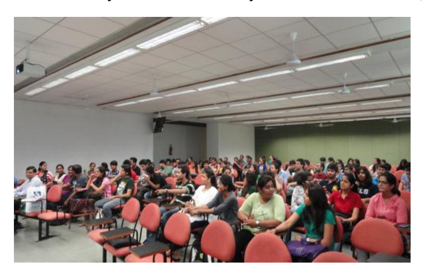
SAI International, Bhubaneswar