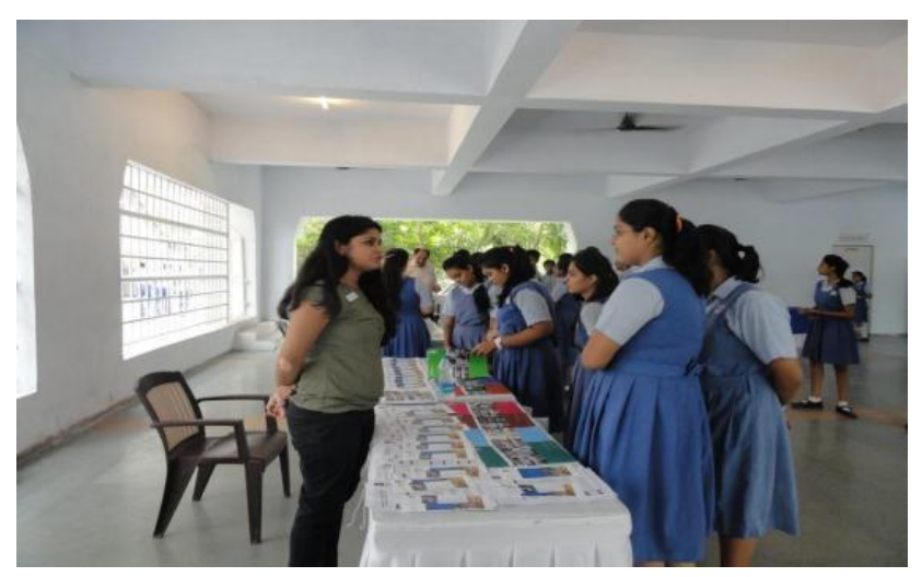
Anand Niketan School, Ahmedabad