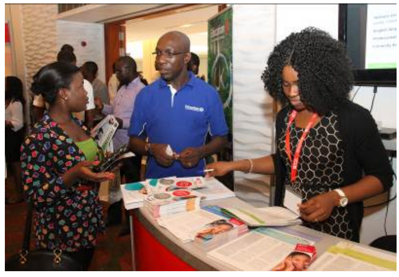
Enquirers at the British Council Information Desk