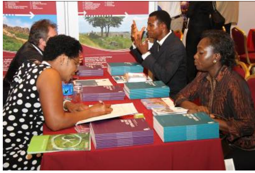
Exhibitors interacting with visitors