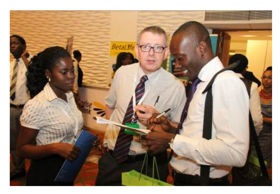
Exhibitors interacting with visitors