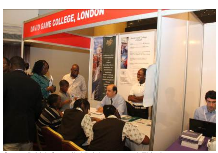
Exhibitors interacting with visitors