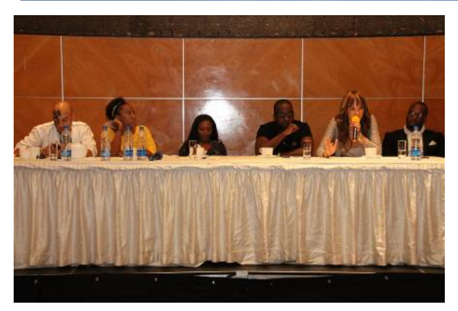
Our Celebrity Alumni Panel for the "Living in the UK" Undergraduate session