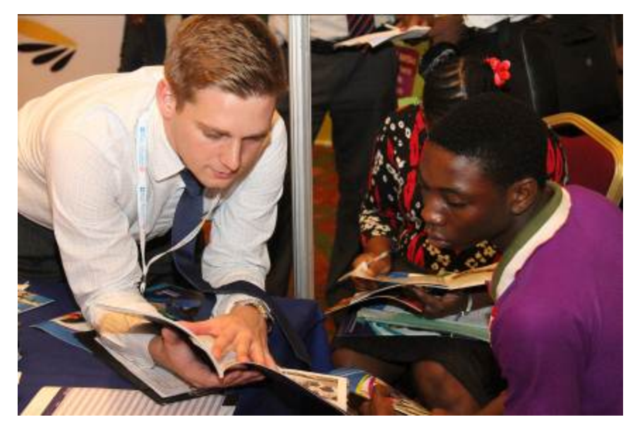
Exhibitors interacting with visitors