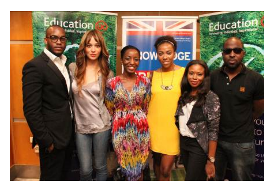
Our Celebrity Alumni Panel for the "Living in the UK" Undergraduate session