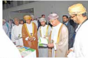
Social Daily staff writer

The participating countries are the United Kingdom, the United States of America, Malaysia, Cyprus, India, Lebanon, Spain, etc. — ONA