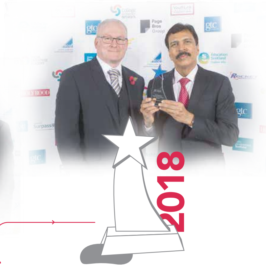
The SQA Star Awards Ceremony 2018 was held on 9th November 2018 to celebrate the outstanding achievements in education and training across Scotland, the United Kingdom and around the world. Saegis Campus was awarded with "The International SQA Star Award" for the Best International SQA Centre.