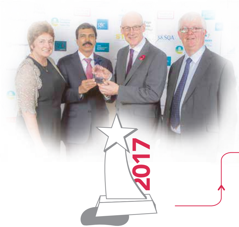
Saegis Campus was honoured with the Highly Commended Category Award for Best SQA International Centre at the SQA Star Awards Ceremony 2017, held on 3rd November in Edinburgh, United Kingdom