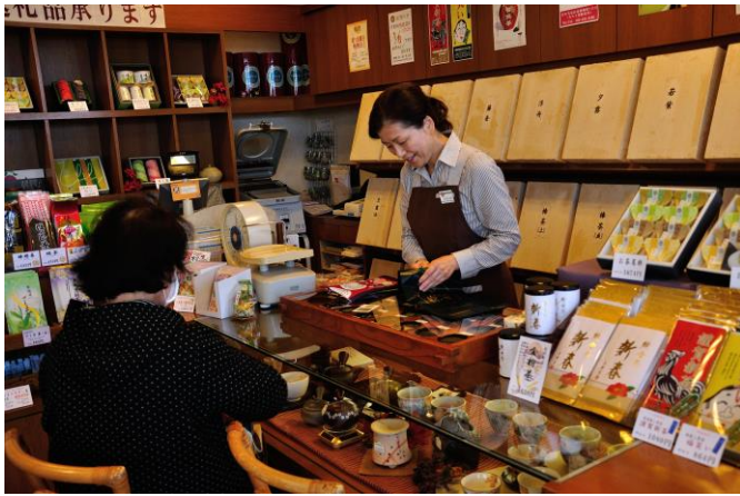
Customers can drink tea in the store