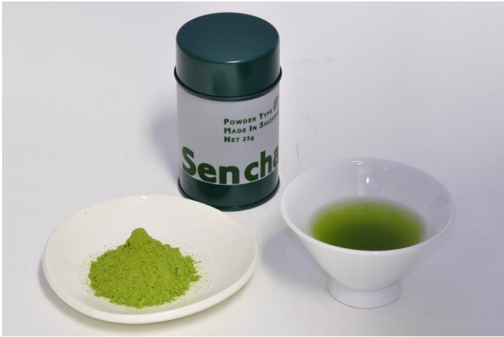
Instant Green Tea