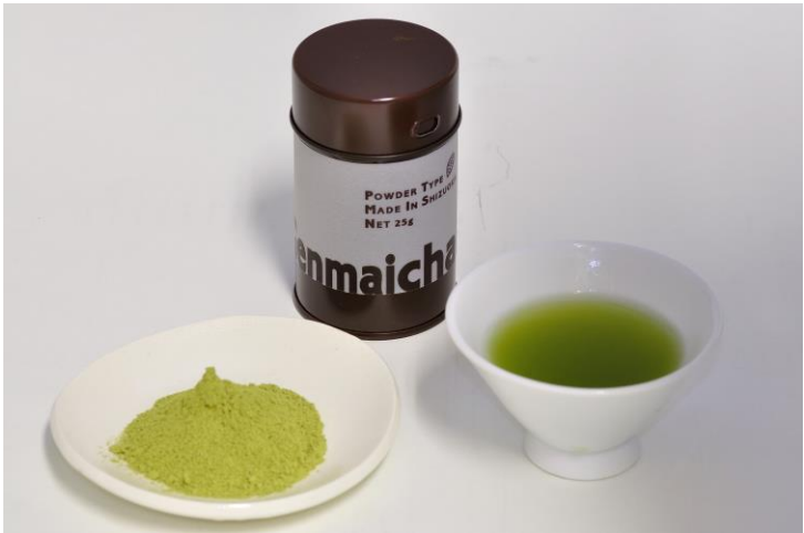
Instant Light Green Tea