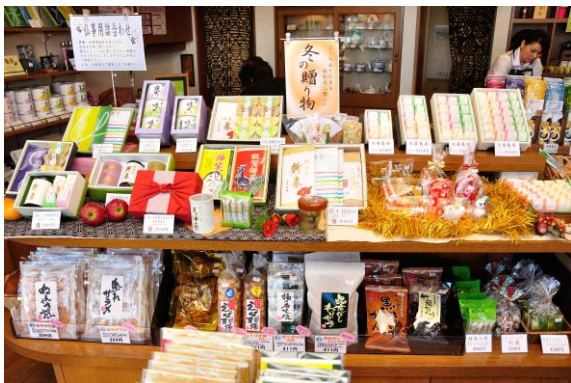
interior of the store

http://www.city.mito.lg.jp/001433/003463/p004128_d/fil/TourismGuide-Eng.pdf