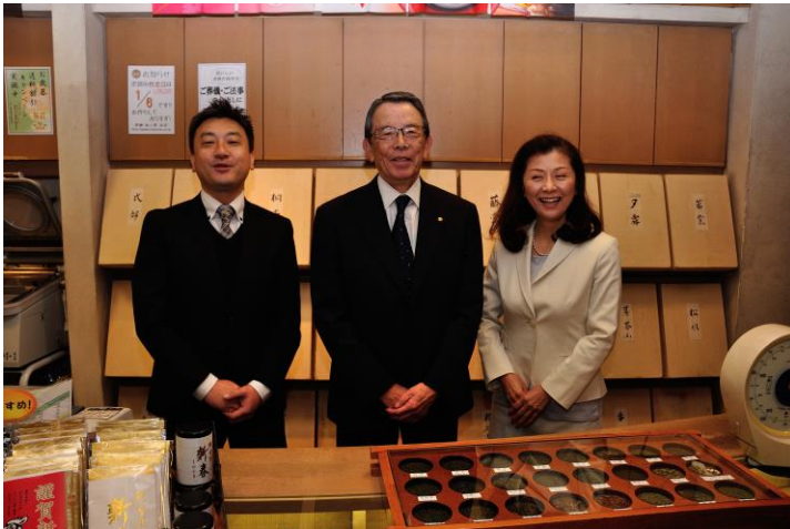
Management team (from left to right: the managing director, the president and the executive director)