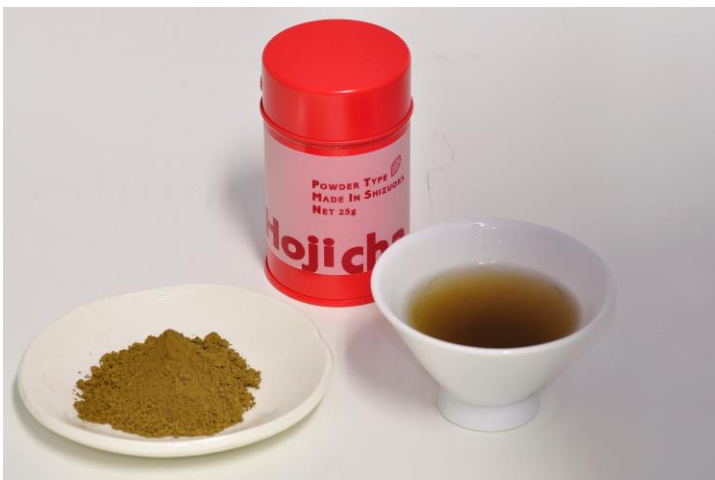
Instant Brown Tea