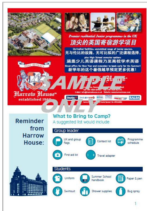
Full page ad. (sample)