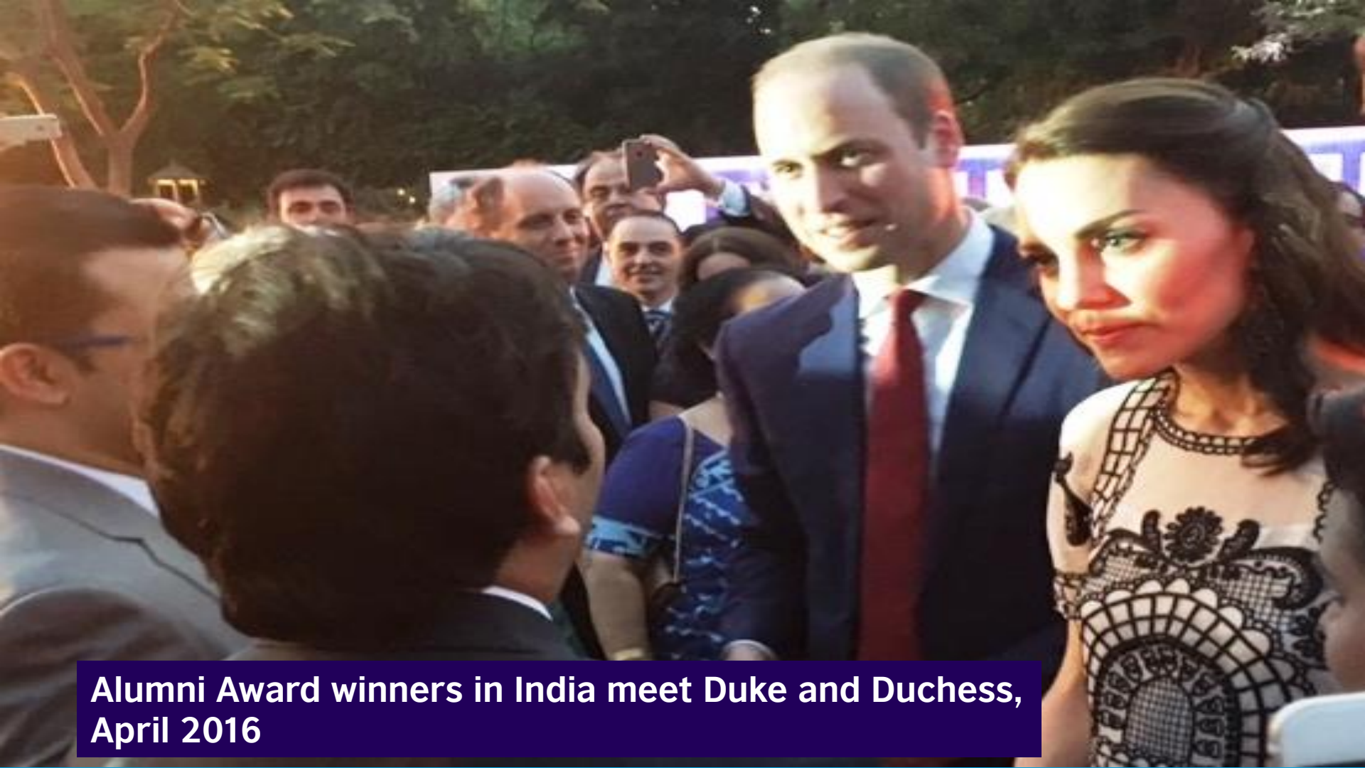
Alumni Award winners in India meet Duke and Duchess, April 2016